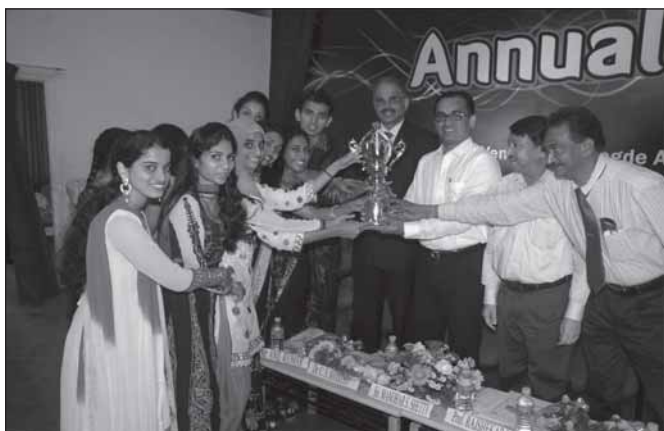
Students of IIIrd Year B.Pharm receiving their trophy