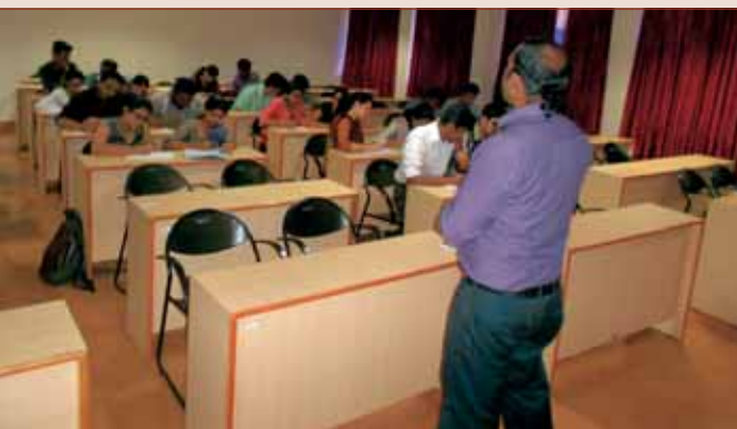
Workshop on soft skills and corporate orientation