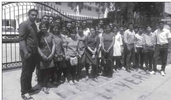
Student of First Year M.Pharm at Natural Remedies