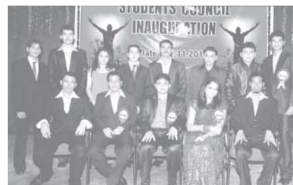
The members of the New Student Council