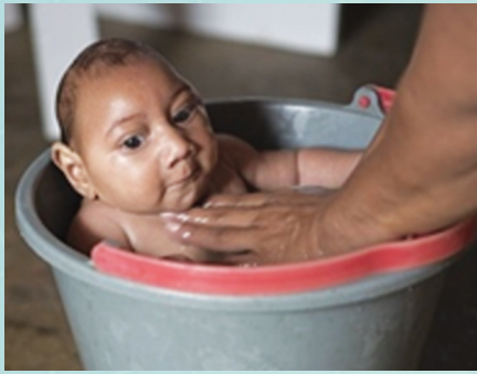
Fig: 3. Microcephaly in new born babies as a result of infected mothers

In newborn babies they are being affected with Microcephaly, it is a condition where a baby's head is much smaller than expected. During pregnancy, a baby's head grows because the baby's brain grows. Microcephaly can