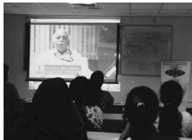
Video of the message from the Secretary, Ministry of HRD - Government of India, played for the students

In pursuance of the directive issued by the Chairman, AICTE that Vigilance Awareness Week October 26 -31, 2015 should be observed by institutions, NGSMIPS organized a lecture and panel discussion for students