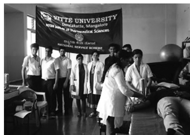
The NSS Unit of NGSMIPS at Wenlock Hospital, Mangalore

The NSS Unit of NGSM Institute of Pharmaceutical Sciences participated in a Blood Donation Camp