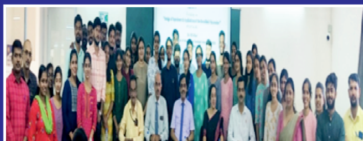
Workshop on "Design of Experiment & Applications of the Brookfield Viscometer"