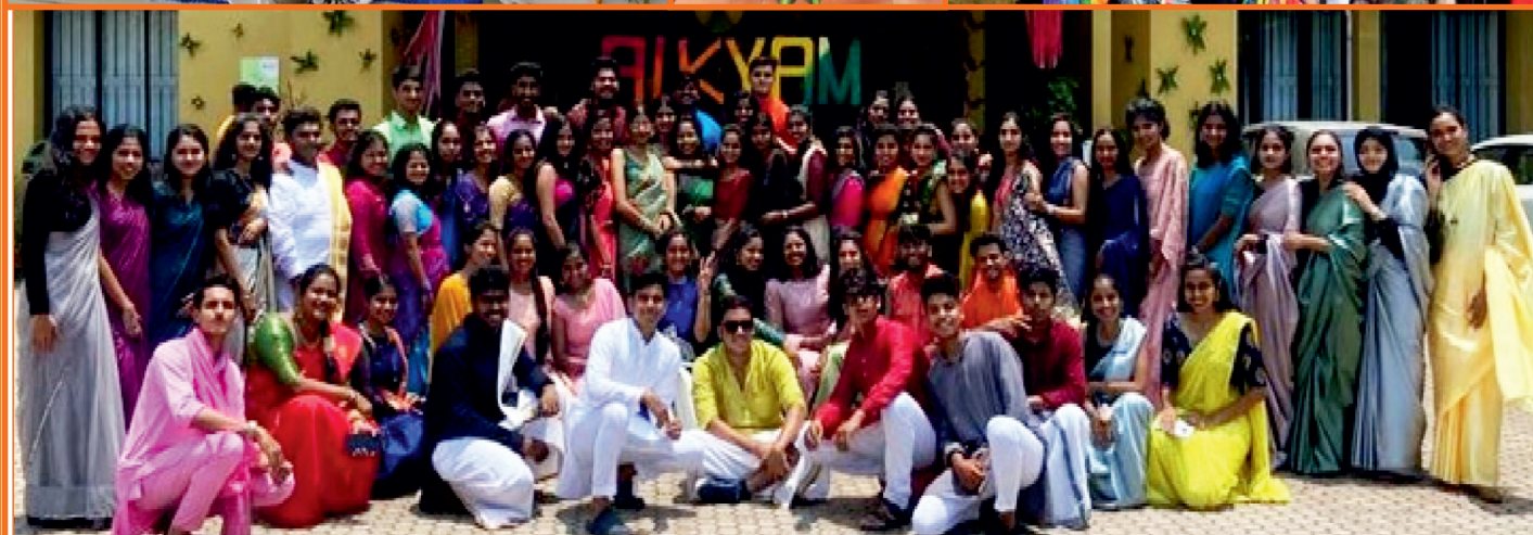
Cultural Day, Aikyam 2021-22