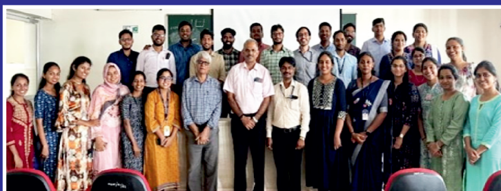
Workshop on "Statistical Analysis Using R Programming Software"