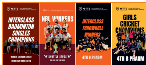
Sports activities 2021-2022