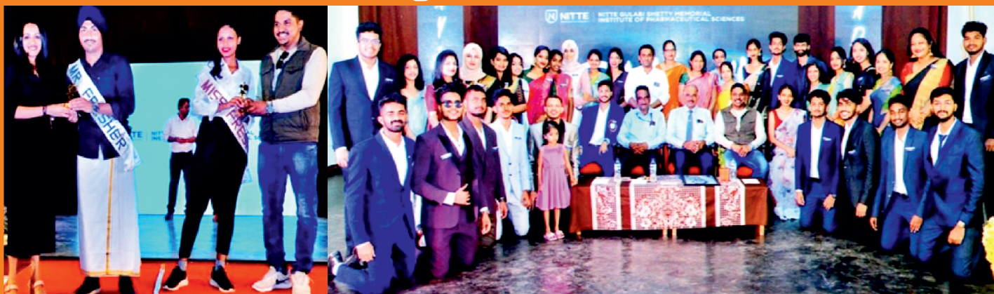
Freshers' day and student council Inauguration 2021-22