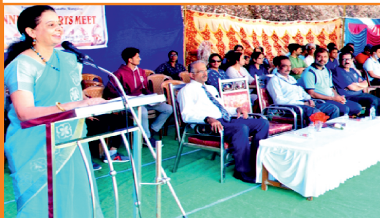
Annual Sports Meet