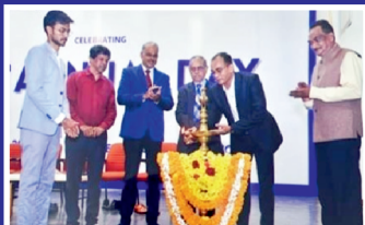
38 th Annual day celebration