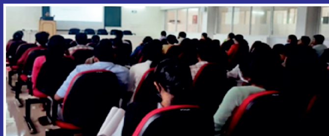
Guest Lecture on "Writing a Research Protocol"