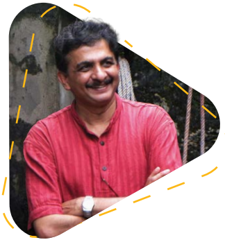
Jayanth Kaikini Author, Poet, Litterateur