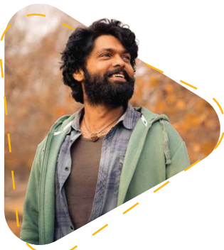
Rakshit Shetty Actor, Filmmaker

As an extension of academics, NICO invites experts from different fields to meet and interact with students. Listed here are a few notable personalities who shared their time and experience with students: