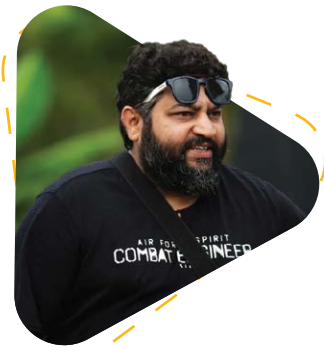
Lijo Jose Pellissery Filmmaker