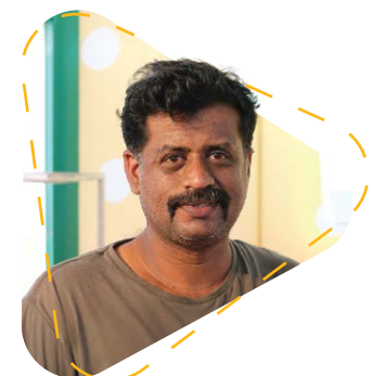
Jeo Baby Filmmaker