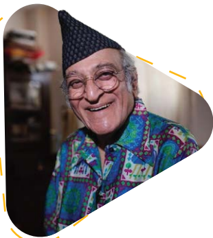
Dr Mohan Agashe Actor, Producer and Director