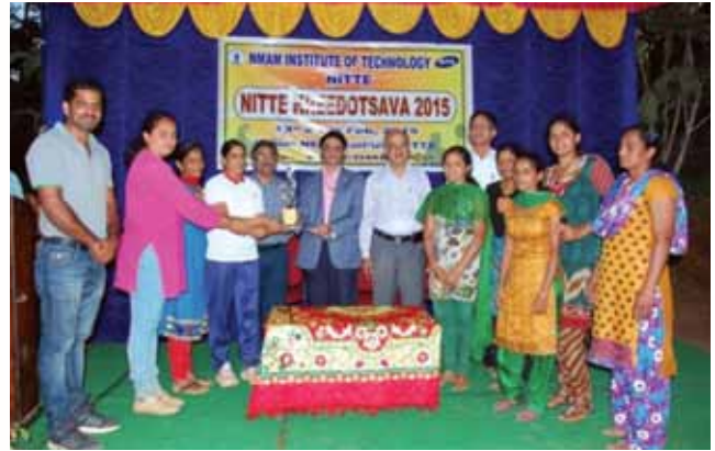
Nitte Accolades 2015.

The college men staff team won the runners up trophy in Karavali Staff Volleyball tournament which was conducted by Poorna Prajna College Udupi on 5th April 2015.