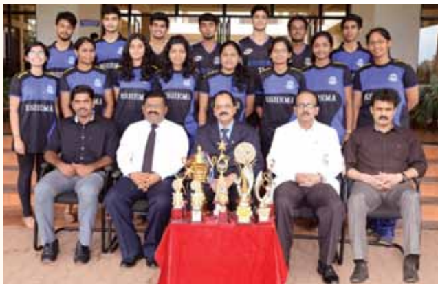
Karavali Staff Tournament

The college men staff team won the runners up trophy in Karavali Staff Volleyball tournament which was conducted by Poorna Prajna College Udupi on 5th April 2015.