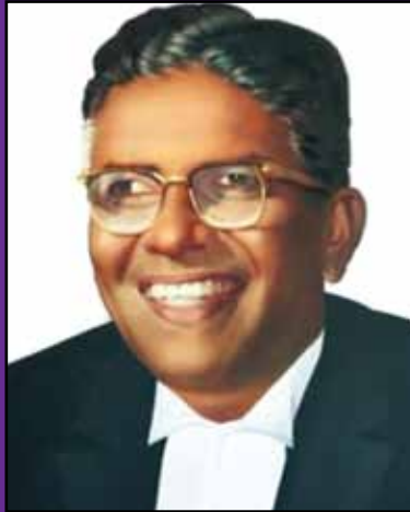
Justice K.S. Hegde Founder, Nitte Education Trust

Kowdoor Sadananda Hegde, born in Kowdoor village of Karnataka State, completed his early education at Karkala and Mangalore. Thereafter, he obtained a degree in Economics from the Presidency College, Madras and a degree in Law from the Government Law College, Madras.