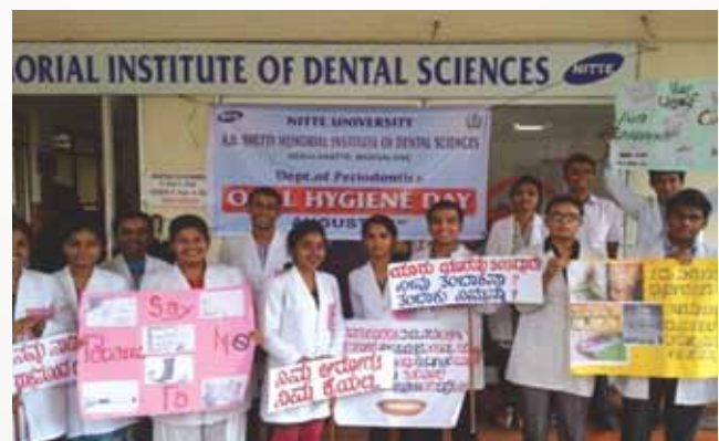
CERP Programme as part of the G S K Budding dentist” on 19/ 7/ 2014“Oral hygiene day” on 1/8/2014